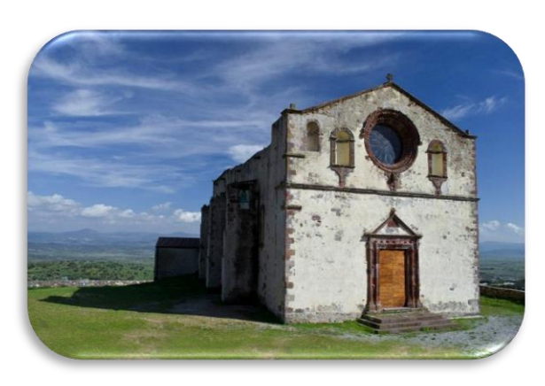
traditions, little known to the media,

The mountain overlooking the town is full of beautiful forests (see Badde Salighes-Ortakis- Mularza Noa) as well as many important springs that feed the river Temo and Coghinas but also the river Tirso.